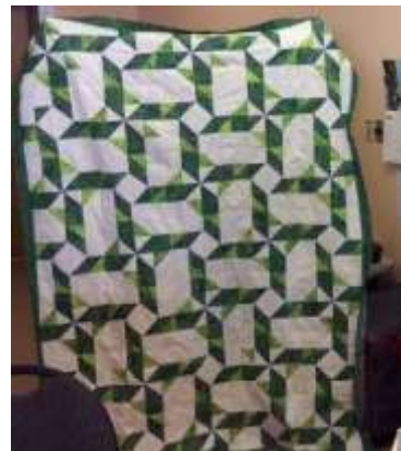
Silver Star STARS Projects