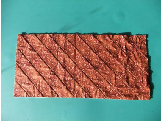
Outside of bag