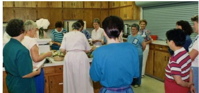
St. John's Lutheran Church