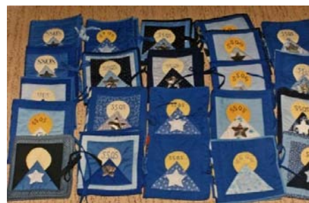
St. John's Lutheran Church