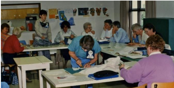
First Baptist Church